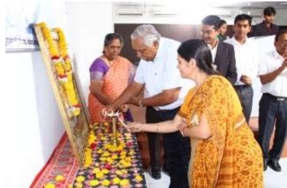
Lightening lamps at Inaugural ceremony